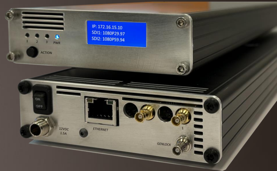
Included Mounting Kit: